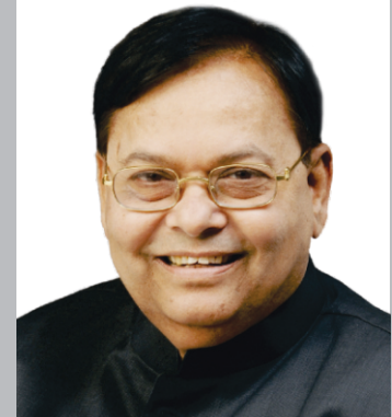
Hon'ble Dr. Patangrao Kadam Founder - Bharati Vidyapeeth

Objective:- To make quality education accessible to the students coming from different regions and different strata of the Society and to provide the same to them as per their individual choices and inclination at affordable prices.