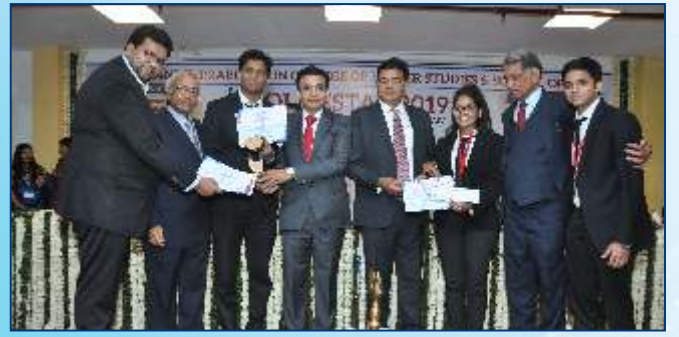
Moot Court Winners being Awarded by Guests in the Valedictory Ceremony