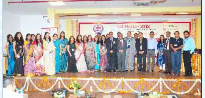
Guests & SoL Team at Valedictory Session of National Conference