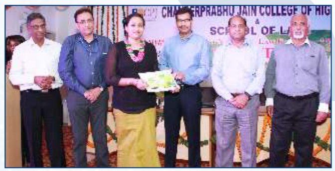
Felicitation of Participants