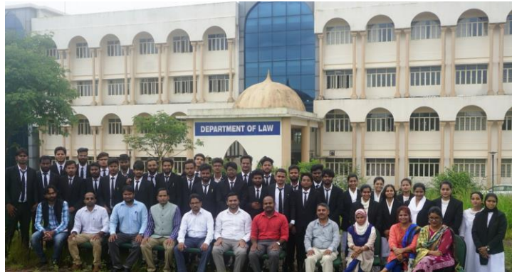
Students Committee Members: