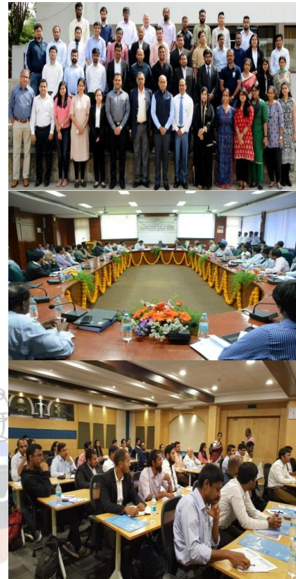
Looking back only to leap forward: A memoir of the previous Certificate Programmes on Sports Law