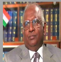
Hon'ble Justice Mr. KG Balakrishnan, Former Chief Justice of India