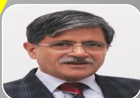
Hon'ble Justice Mr. SN Dhir Former Judge Delhi High Court