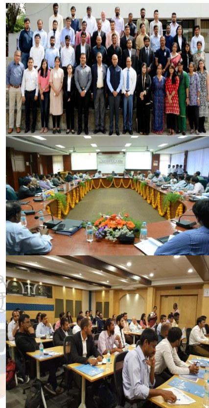
Looking back only to leap forward: A memoir of the previous Certificate Programmes on Sports Law

CEERA undertakes regular consultation engagements whereby it provides counsel and assistance to its clients, on matters relating to Contractual Drafting and Negotiation; Due-Diligence, Policy Formulation for improved Corporate Governance. Our team has assisted in setting up of businesses, through Incorporation and otherwise. The Clientele assisted by our team involve renowned MNCs, Start-Ups, Government Agencies and Individuals.